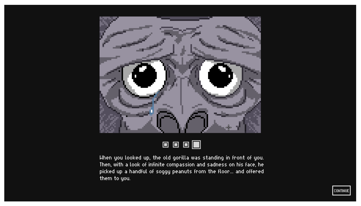
"Mediocre Monkey" end.

branching path structure, as well as curiosity, which attack the most instinctive part of the human being, the most primitive, because, in the end, the player is the one who decides to accept the terms and conditions. He is the one who looks at the apes and chooses to feed them, but why does he do it? Does he want to feel superior? Does he believe that his moral judgment is the right one? Or, does he know it is all just a game, and, what does it matter? They are just binary numbers, right? Monkeys don't feel, don't think. They're there for us to throw them some peanuts and dance to our will.